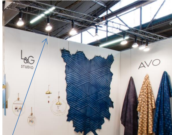
Example of Truss and Truss Fixtures

In the MADE section, exhibitors who would like to hang fixtures from the existing truss or hang fixtures from a unistrut bridge must contact Sergio Camargo at scamargo@mmart.com .