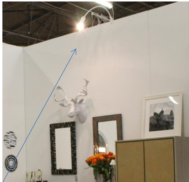
Example of Gooseneck Fixture clamped to wall

Lighting packages for MADE and SHOPS are available and can be ordered using the Application for Electrical Service: MADE & SHOPS which can be found on exhibitorinfo.com/architectural-digest-design-show/